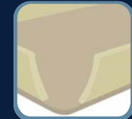
HIGH DENSITY FOAM ENCASEMENT