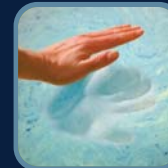
GEL VISCO LUMBAR SUPPORT